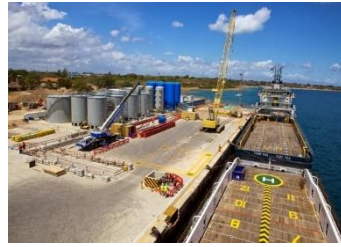
Ports and Maritime

Rendel is an equal opportunities employer.